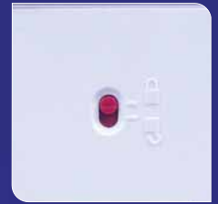
Load cell lock