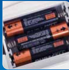
Battery Operated (3x AA)