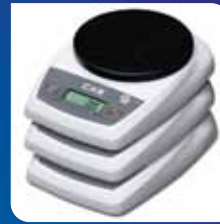
Stackable Design for easy and safe storage